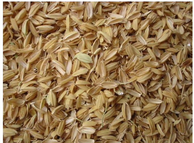
Fig 1. The rice husk

In addition there is an alternative energy source that may be less known, namely biomass. The biomass is one of alternative energy to generate electrical power [2]. The rice husk is a biomass type with very abundant availability in South Sulawesi, Indonesia.